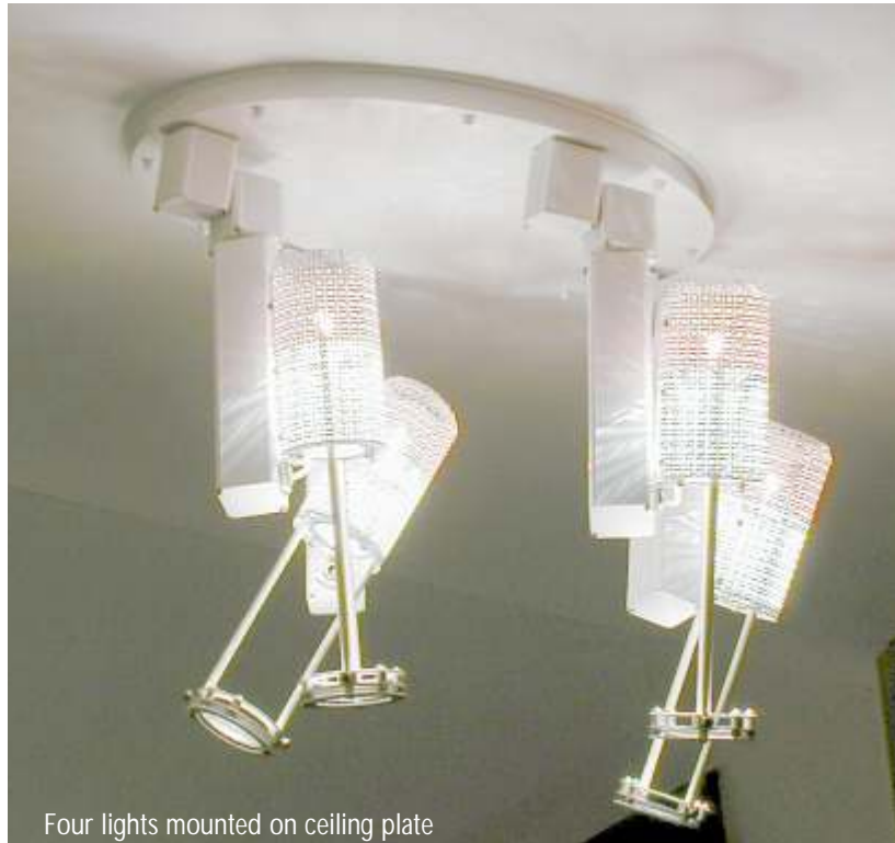
Four lights mounted on ceiling plate

The RadiantLite creates three lighting effects in one fixture. First, it creates a concentrated beam of light for display lighting. Next, backlighting for a unique ceiling indirect lighting effect. And lastly, the RadiantLite has a chandelier lighting effect created by the light glimmering through the housing.